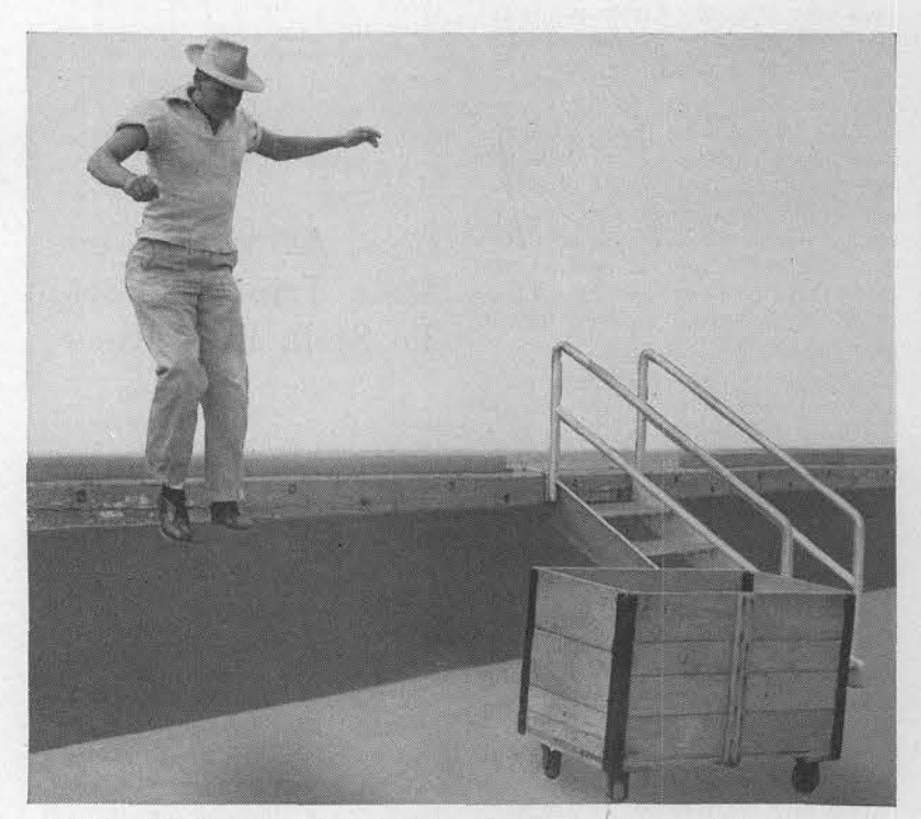
INVITATION to an injury is being demonstrated here. Why jump off the platform when it is easier (and safer) to use the stairway? Pain and suffering from this type of carelessness can be considerable.

Look at these accompanying pictures, study them and remember that employees have been injured doing just what these folks are doing. It might be you.